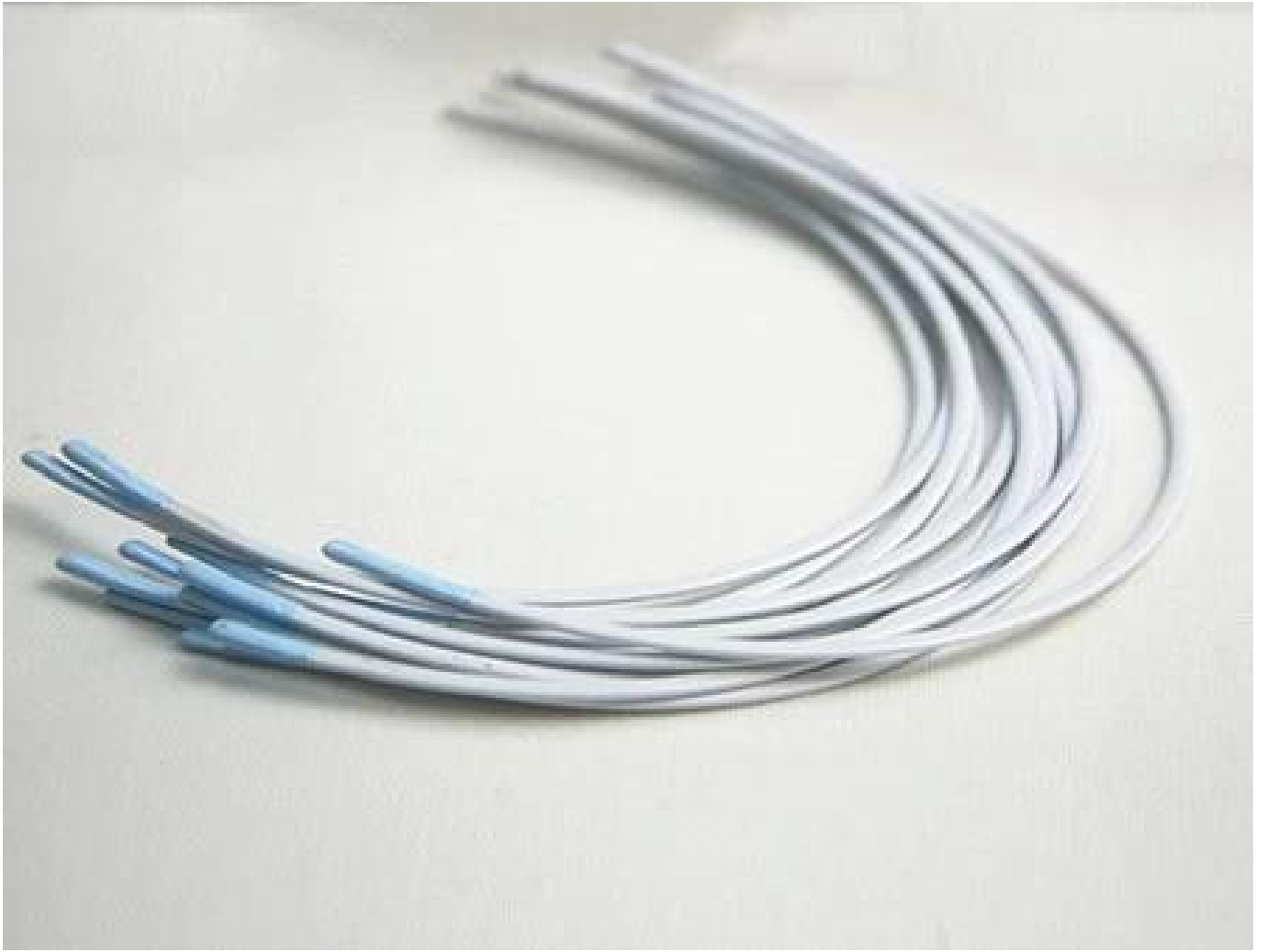
Titanium alloy memory wire.