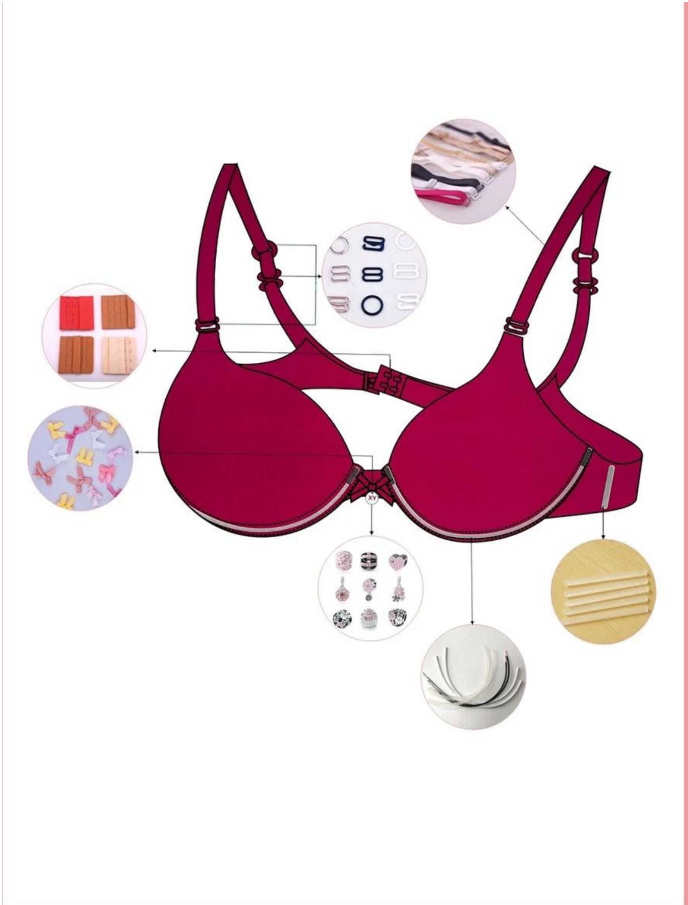
Clear Plastic Boning