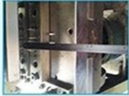
2. Hit the hole