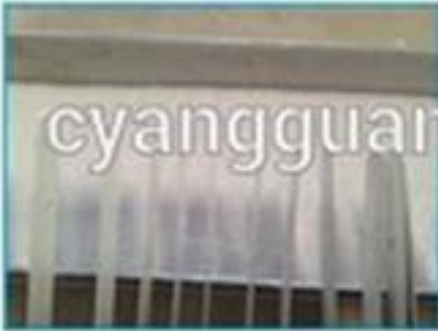
3. Paint and bake