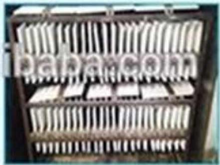
4. Second paint and bake