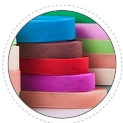
1 A variety of colors