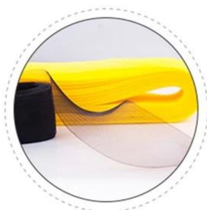
2 Flexible and durable