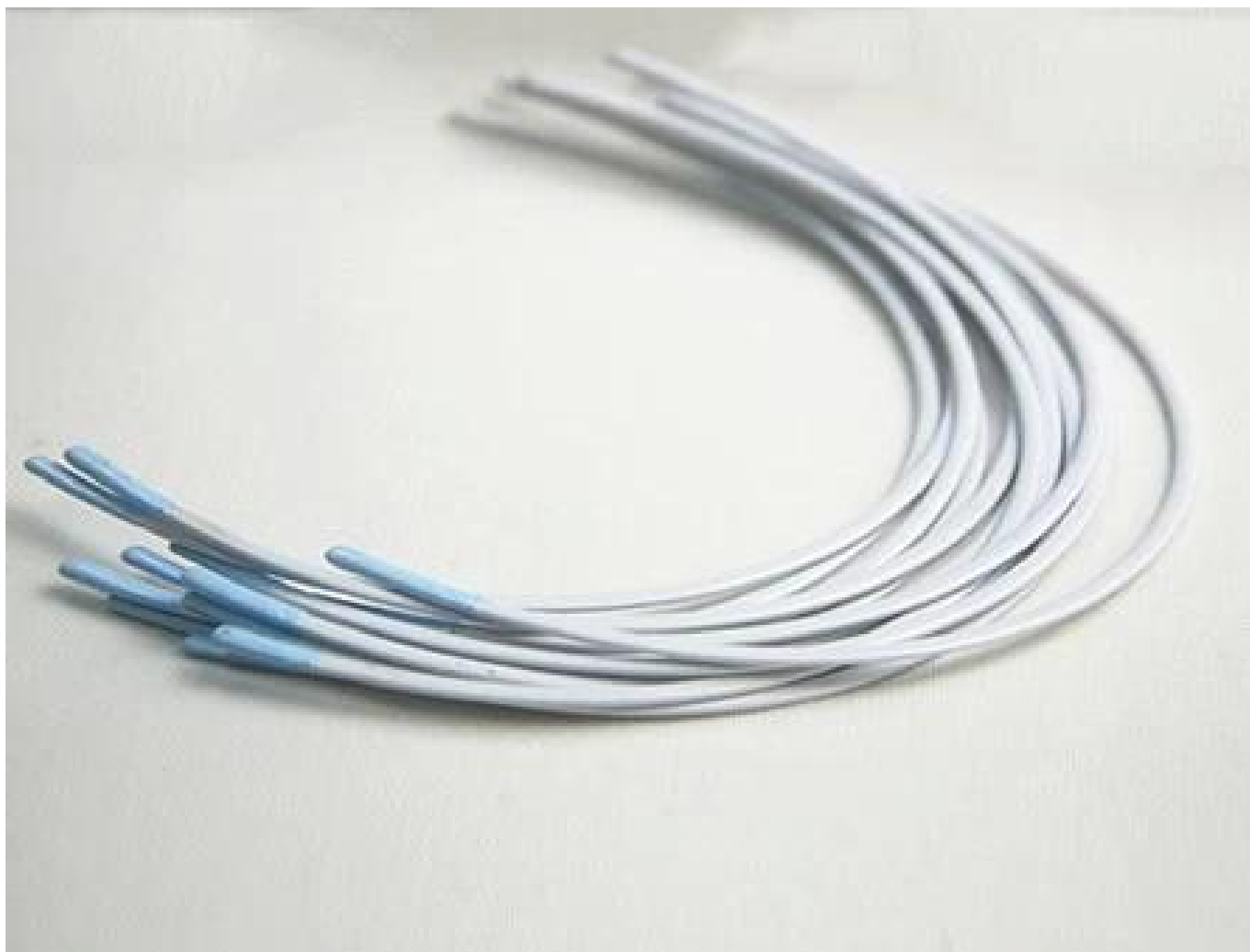
Titanium alloy memory wire.