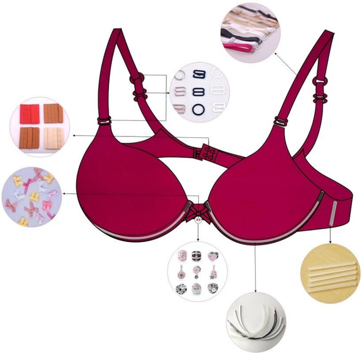
Clear Plastic Boning