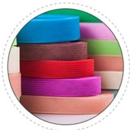
1 A variety of colors